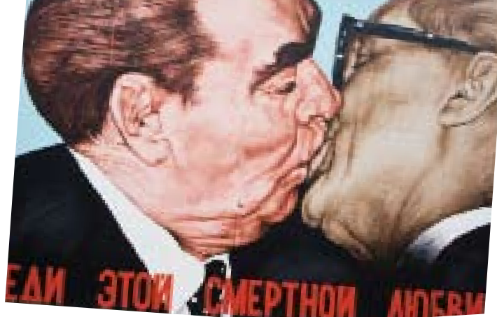
Mural of Erich Honecker and Leonid Brezhnev.